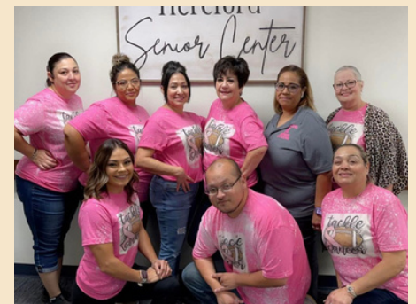
Hereford Senior Citizen Center staff supporting Breast Cancer awareness month

During breast cancer awareness month, BSA Harrington Cancer Center encourages you to wear pink to show your support and spread awareness. To schedule your mammogram, please visit: harringtonbreastcenter.org/appointments