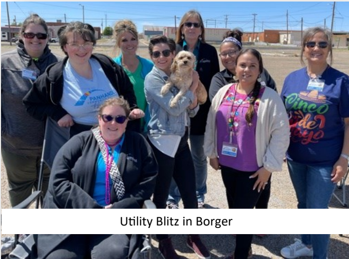
Utility Blitz in Borger